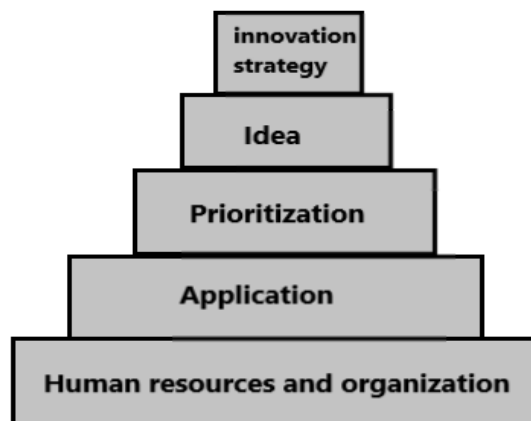
Figure 1. Pyramid of Generating and Implementing Innovation.

Source: Adapted by Iliev V., In Support of Innovative Management of Small and Medium Enterprises